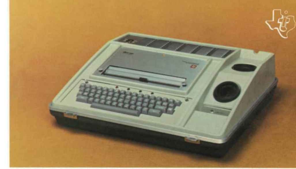
Model 725 portable data terminal includes a built-in acoustic coupler and may be used anywhere a telephone and electrical outlet are available.